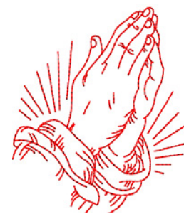
Example of redwork embroidery of praying hands

One of our projects for the 2025 celebration will be a quilt made by us, the people of Church of the Ascension. It will be a traditional Red Work quilt, the type that was made in 1875 and is still made today. Each square will represent the Christian faith with an explanation of how we celebrate it today. Anyone is welcome to volunteer to embroider a symbol and be acknowledged in the explanation of their square. All squares will be on the same fabric using the same floss. Fabric and floss will be available at sign up in the main office.