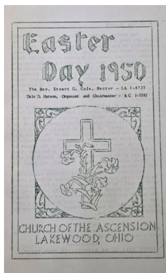
Easter Bulletin (1950)