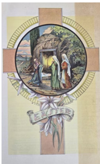
Easter Bulletin (1947)